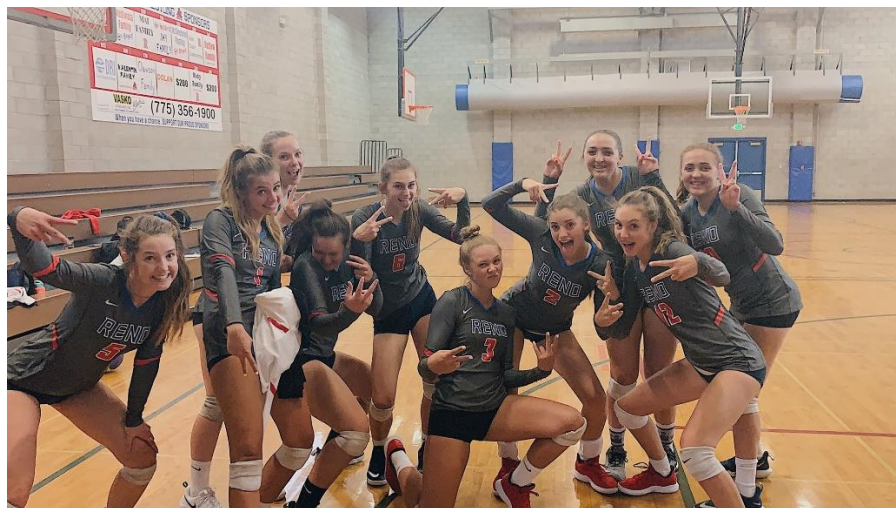
Don't miss watching our Volleyball Team this year!