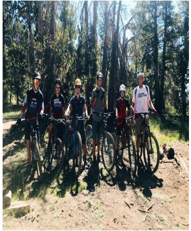
Mountain Biking Club looking good!