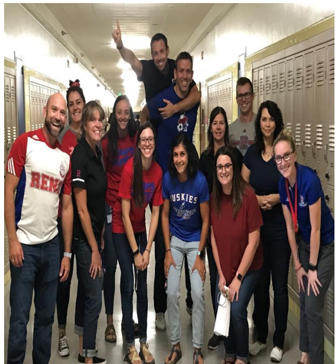
RHALL teacher representing!